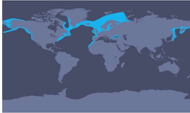
Distribution map (Whale and Dolphin Conservation)

Harbour porpoise are the only member of the porpoise family found in European waters. They are distributed all around the UK coast. Their range reaches across the temperate cool coastal waters of the Northern hemisphere. There are three candidate Special Areas of Conservation (SACs) for harbour porpoise in Wales, the West Wales Marine SAC covers Cardigan Bay.